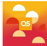
QS Higher Ed Summit: Americas 1-2 October | Guadalajara, Mexico