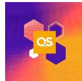
Reimagine Education Conference & Awards 1-3 December | London, UK

For more information on joining or sponsoring our conferences, please scan the QR code