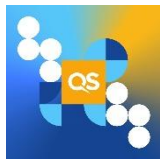
QS Higher Ed Summit: Middle East 19-21 April | Abu Dhabi, UAE