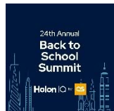
Back to School Summit 8-10 September | New York, USA