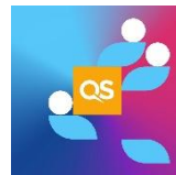
QS Higher Ed Summit: Europe & QS MoveON Conference 24-25 June 2026 (Europe Summit) & 25-26 June 2026 (MoveON Conference) | Budapest, Hungary